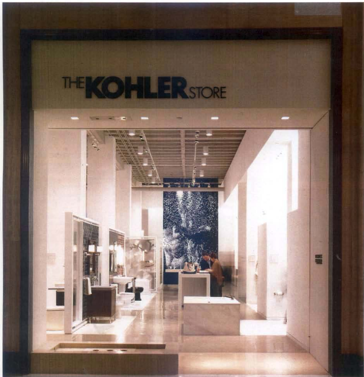
Above: Exterior of The KOHLER Store ■ Below: Some collections are exhibited in vignettes