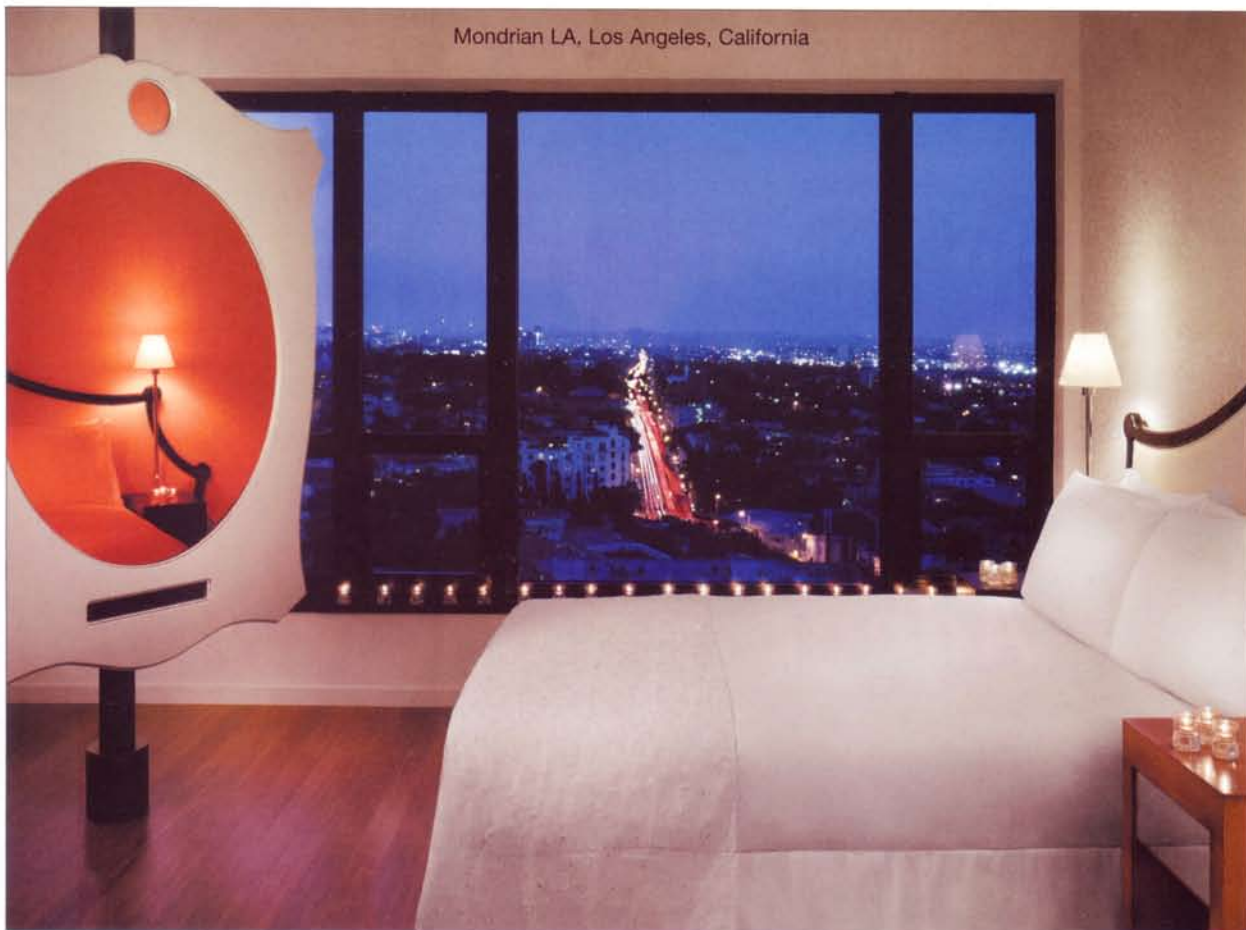
Mondrian LA, Los Angeles, California